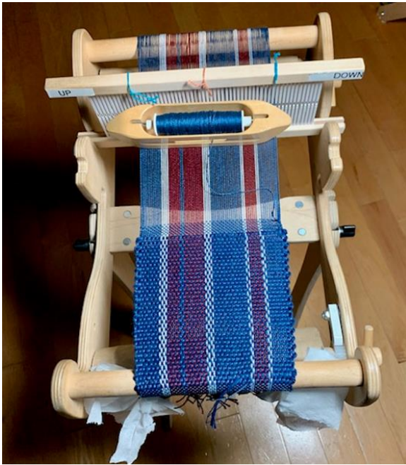
A sample of weave: